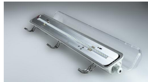
Features: Multi colour LED status indicator & test switch