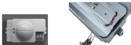
In built microwave sensor