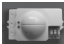
In built micro wave sensor