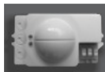
In built micro wave sensor