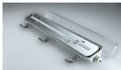
Features: Multi colour LED status indicator & test switch